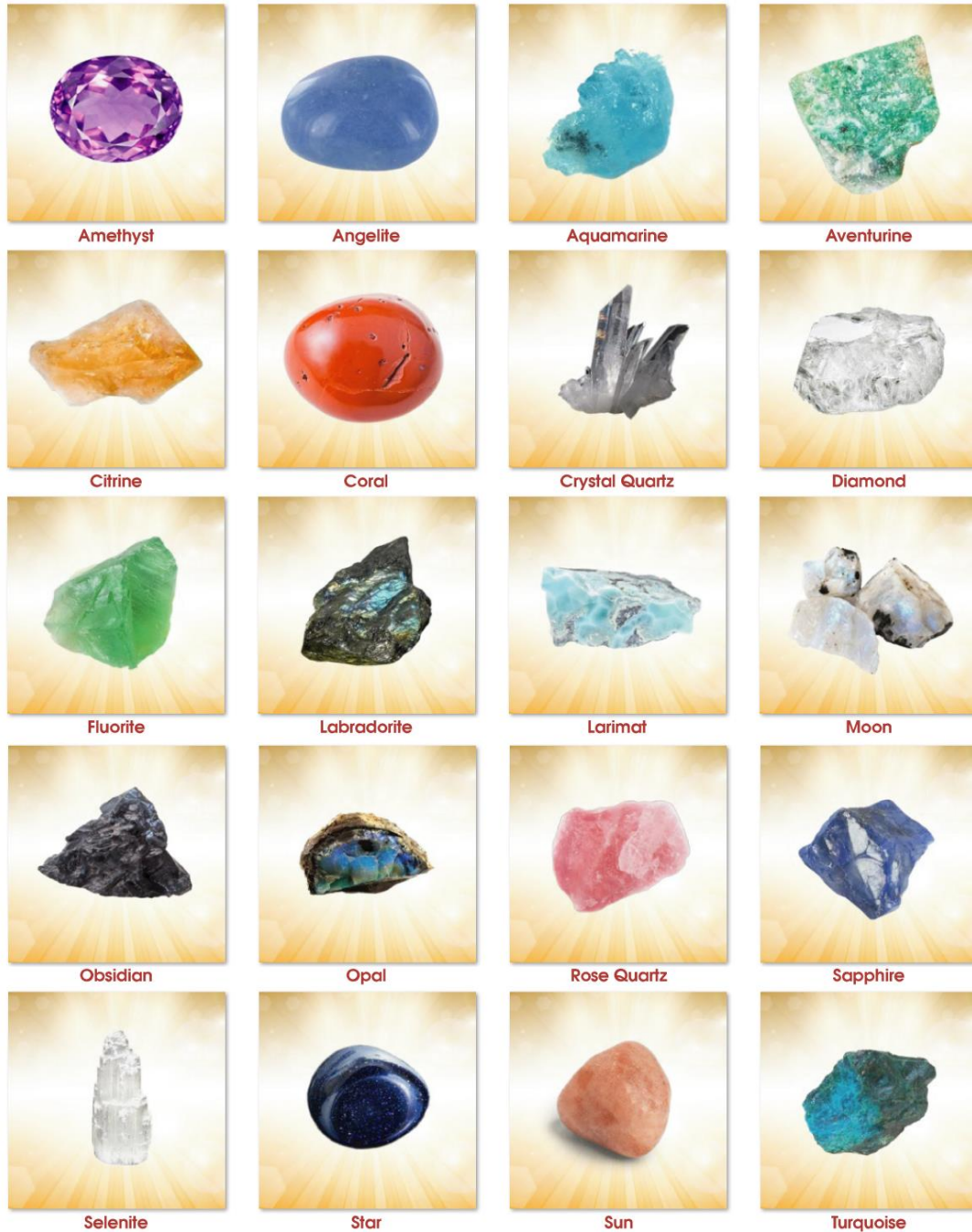
FIGURE 7 – REIT NFT STONE CODES