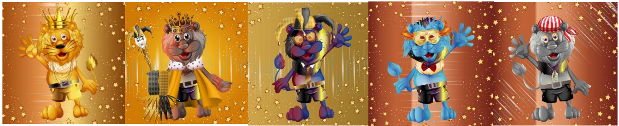
FIGURE 3 – BEAUTIFUL AND COSMIC REITLIONS