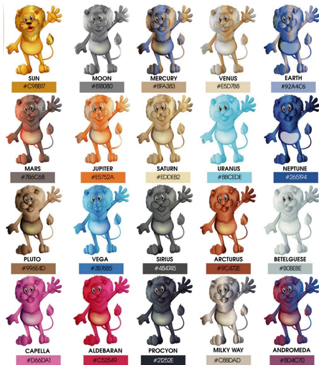
FIGURE 5 – REIT NFT COLOR CODES