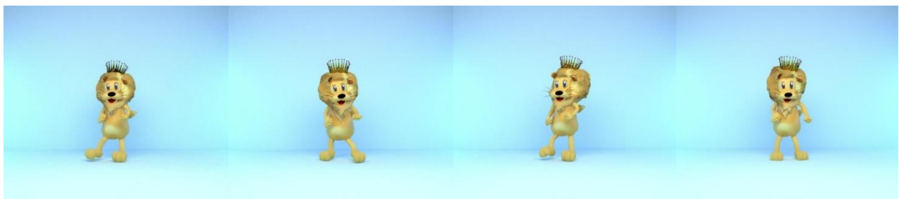
FIGURE 11 – THE DANCING LION – AUGMENTED REALITY APPLIED (3D) – V1

Development of advanced versions of 3D are planned in the REITLION Project ROADMAP.